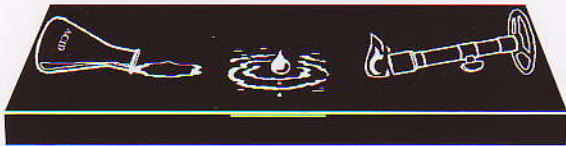
Chemical Resistant • Non-Absorbant • Self-Extinguishing

Epoxy Resin work surfaces are durable, non-porous, man-made stone products that are relatively unaffected by most chemicals, heat, flame and moisture. These super-tough surfaces' physical properties are seldom compromised; however, they do require periodic care and maintenance throughout the life of the lab or school room to keep the surfaces looking like new. Whether you are a facility owner, manager, custodian or lab user, it is helpful to know how to maintain the good appearance of your lab's work surfaces.